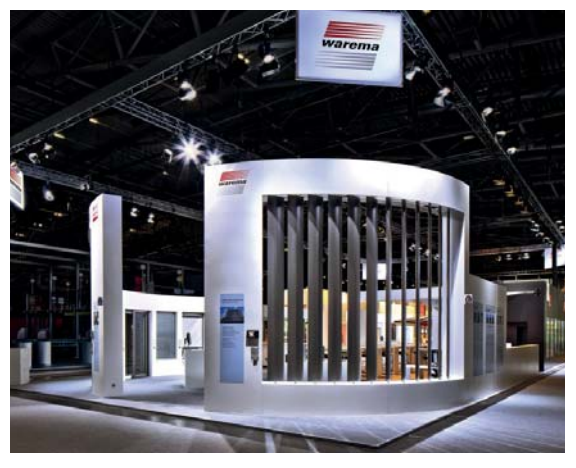
Large louvre blind system by Warema