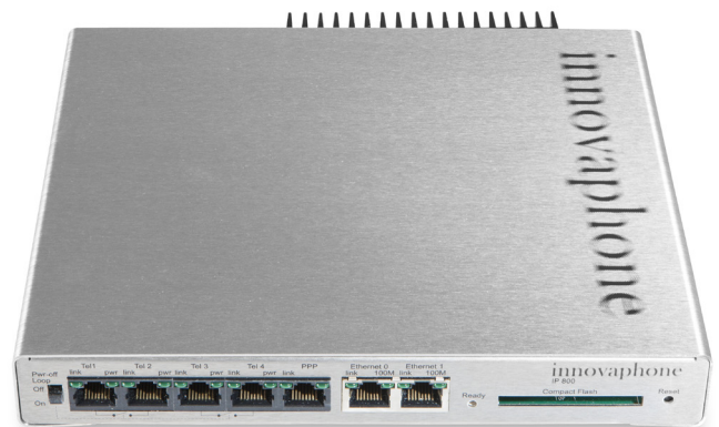
innovaphone IP800 VoIP gateway